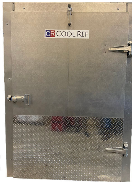
Freezer/Cooler Swing & Slide Door