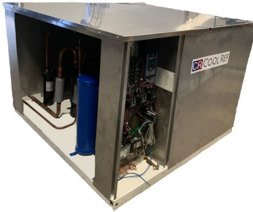
FIX Condensing Unit