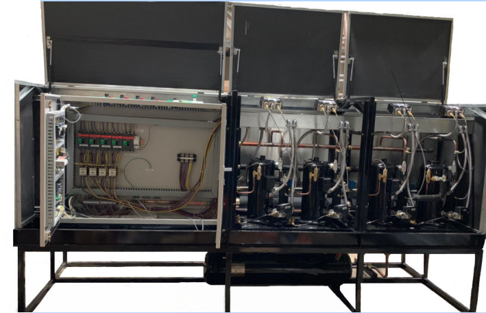
FLEX Refrigeration Rack